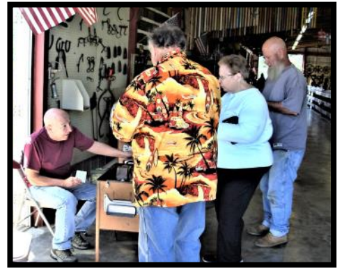
Peanut sales were excellent...on a par with one-day at the State Fair!