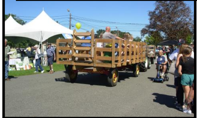
A good turn-out for the event...the shed was continually full of interested people!